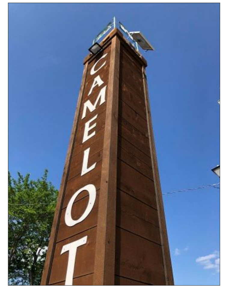
Camelot ~ 2020 Garland Neighborhood of the Year